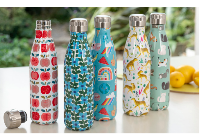
Ring binder £3.95, retro alarm clock £12.95, A5/A6 notebooks £3.95/£1.95, set of 2 tins £6.95, jumbo bag £4.95, table lamp £8.95, stainless steel water bottles £19.95