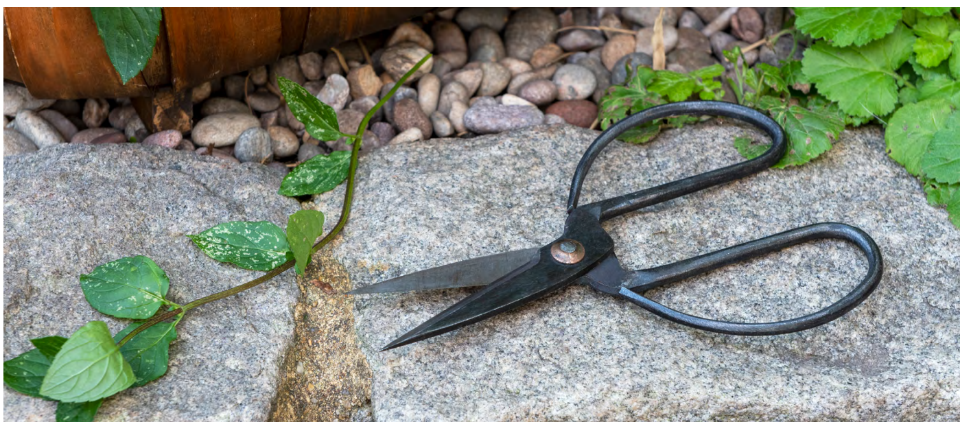
Twine in a tin £4.95 each, bug hotel £19.95, butterfly & bee hotel £19.95, gardener's scissors £4.95